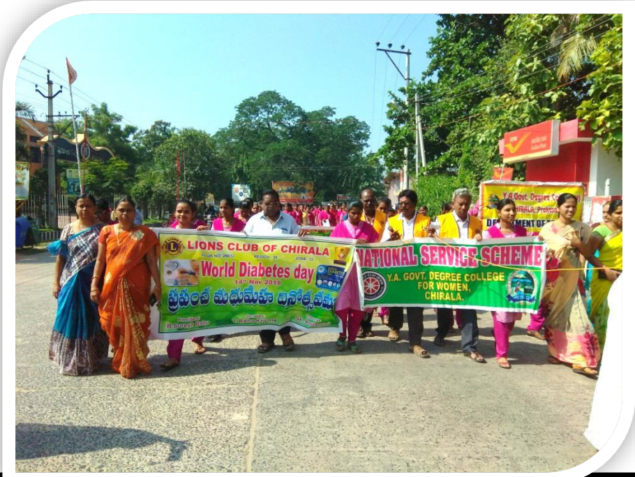
S.NO.23.Nameoftheactivity: World diabetes day Staff Participating in World Diabetes day on 14-11-2018