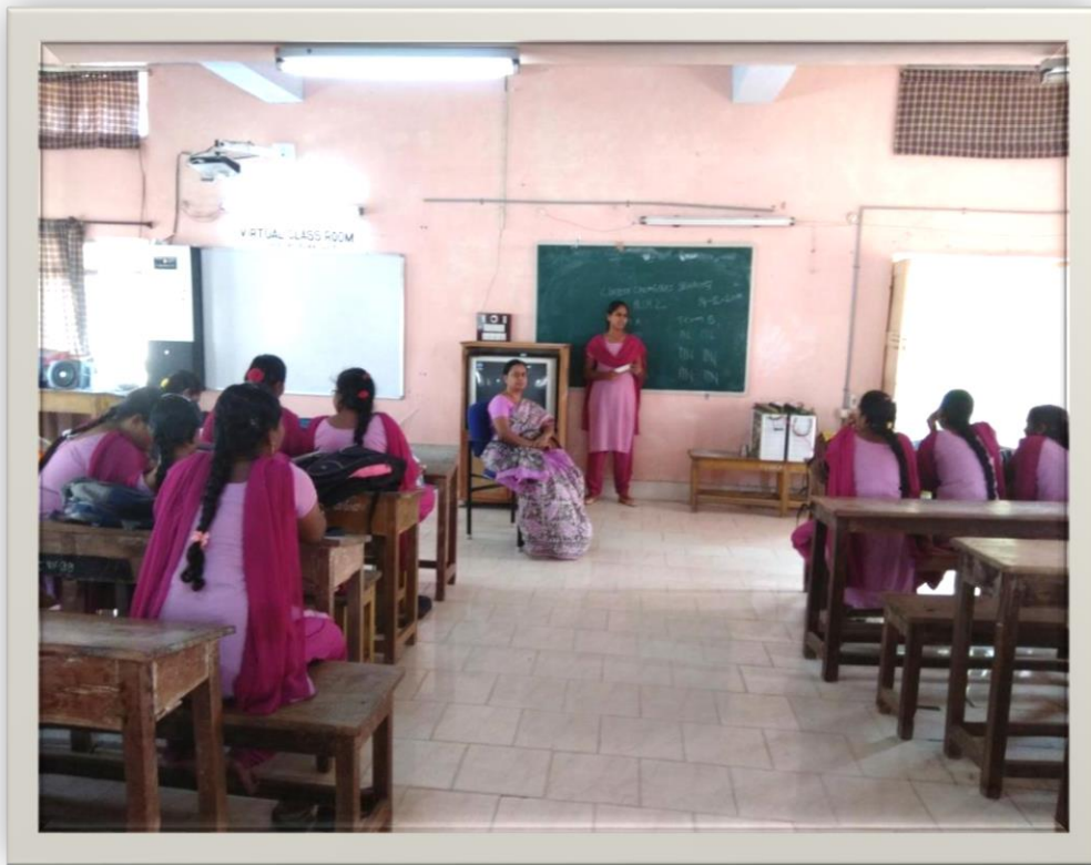
Quiz on 15-